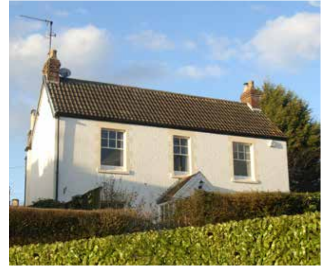
Traditional cottages can have group value, whilst churches, bridges and mills may be landmark buildings or have historical associations

The process of identification of locally listed heritage assets is on-going. It includes one-off suggestions as well as being encouraged through community participation, for example, in the form of village design statements, conservation area appraisals, thematic studies and landscape appraisals. Many of Bath and North East Somerset's Parks are already recognised for their local historic value and contribution towards local distinctiveness and are consequently locally listed.