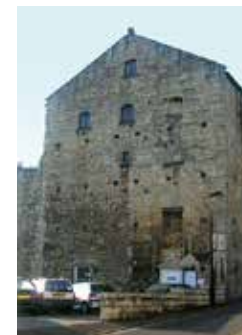
19th Century former Malt House

The Old Mills Batch is a local heritage asset with significance deriving from its evidential, historical and communal value relating to the history of the coal mining industry in Somerset.