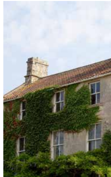
Many attractive historic buildings in the area are not statutory listed.

The objectives of this Supplementary Planning Document (SPD) are to raise the profile of and give recognition to buildings and structures and their settings that contribute to the special character of Bath and North East Somerset; to provide information and guidance on how these assets are identified; to encourage their conservation and repair and to provide development management guidance where they are the subject of planning applications.