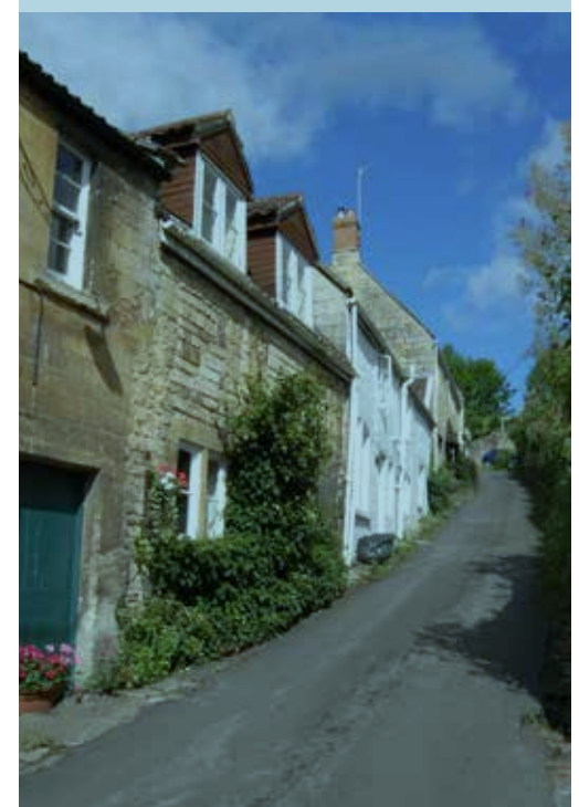
Top Belgrave Crescent