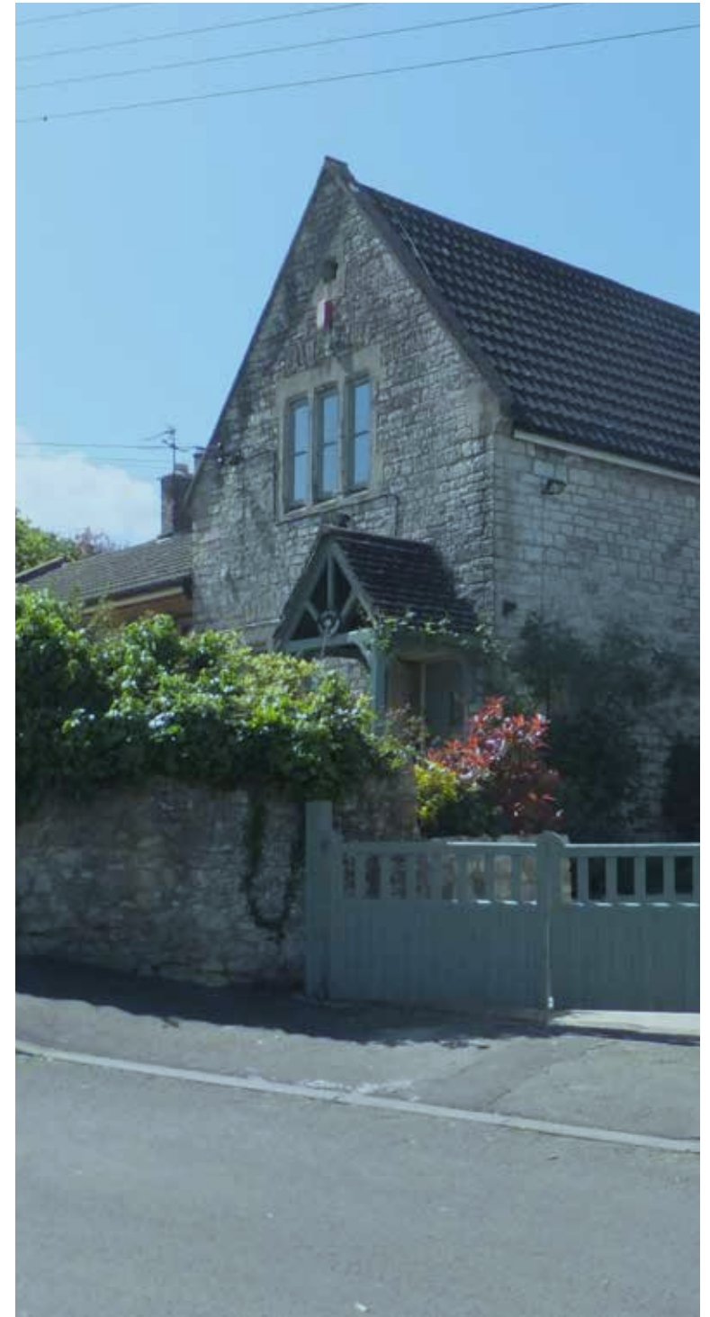
Old School House, Writhlington

The setting of a locally listed asset may include land outside the building's curtilage and could include adjacent land, important views or the wider street scene.