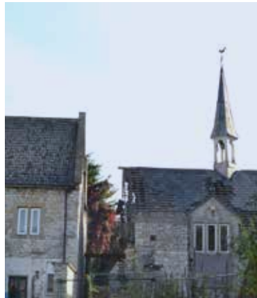
St Nicholas School, Radstock

In cases where permission is granted for the demolition of a locally listed asset, the Council may require that provision is made by the developer to accurately record the asset prior to its demolition. There will be an expectation that the asset is replaced with one that makes a positive contribution to the character of the locality.