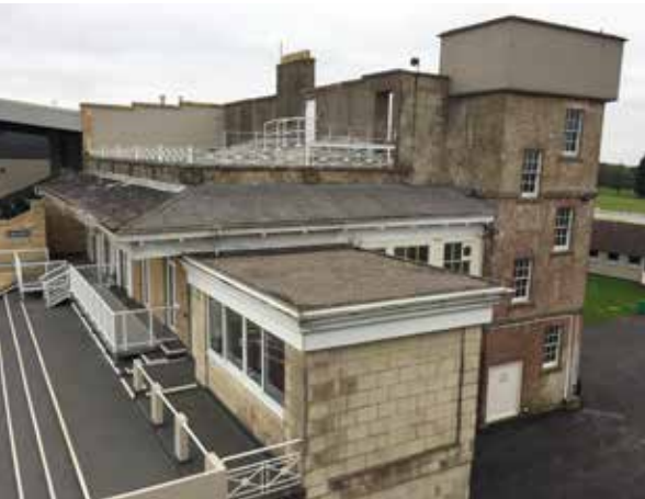
Early C19 County Stand at Bath Race Course.

Below Historic vernacular along London Road West, Batheaston